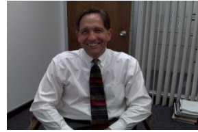
State Board of Elections Assistant Executive Director