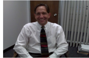
State Board of Elections Assistant Executive Director